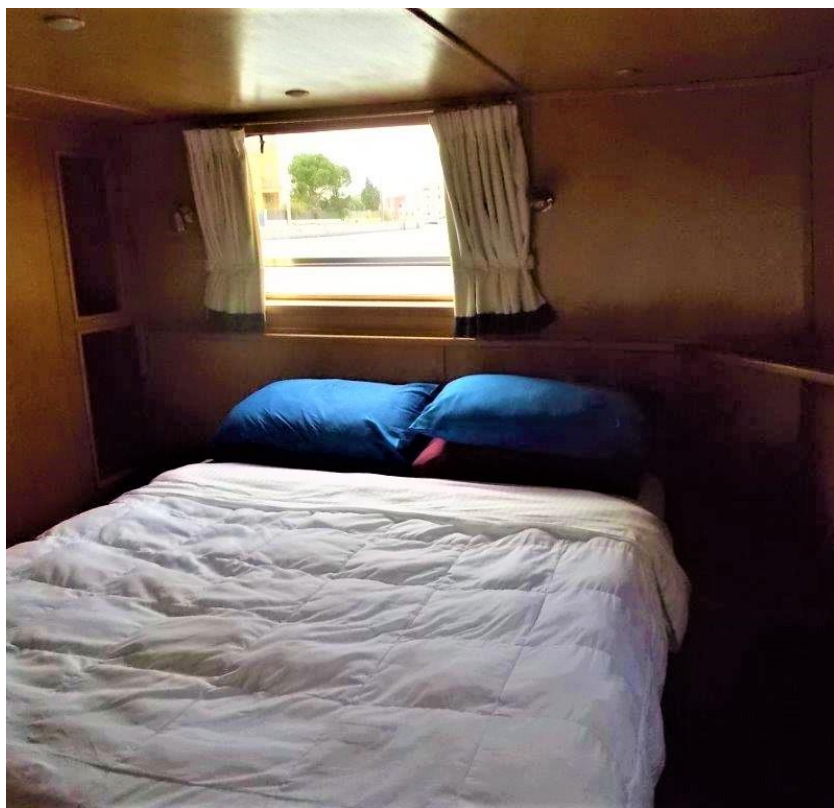
Steps down aft from the wheelhouse lead to a spacious king size, walk around double berth 'owner's' cabin.....