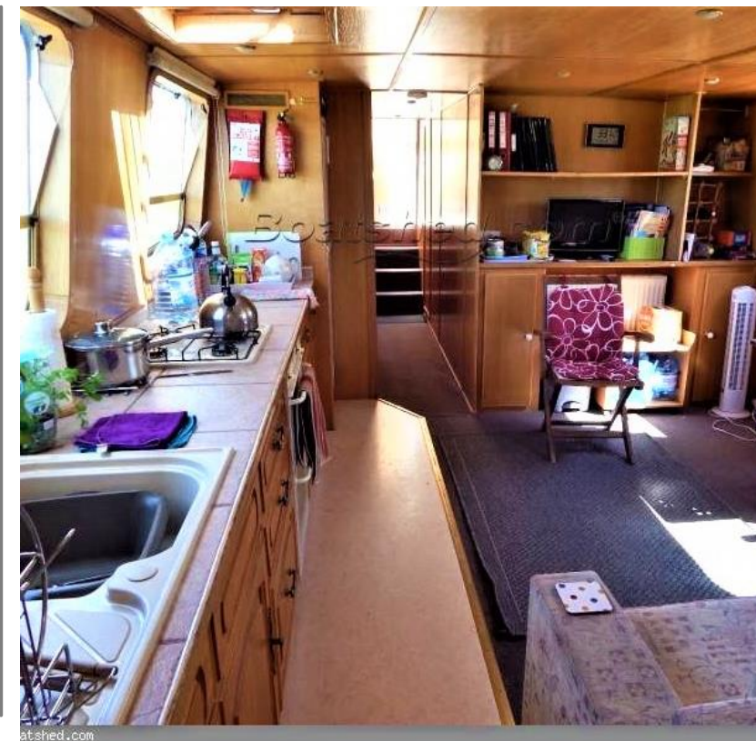
Steps down forward lead to the saloon which offers a sofa that converts to a double bed and a large, well equipped galley.