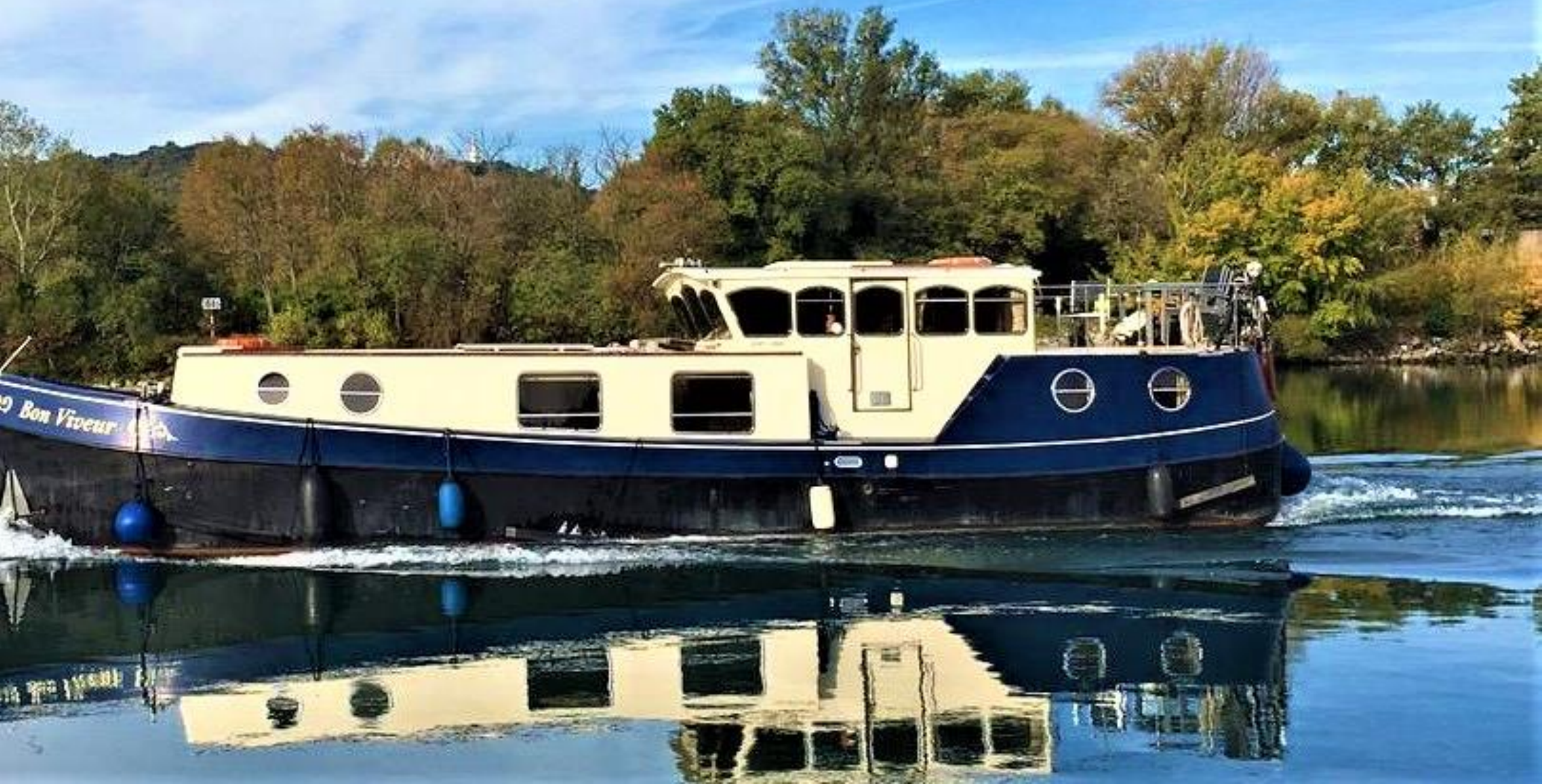
The Bon Viveur