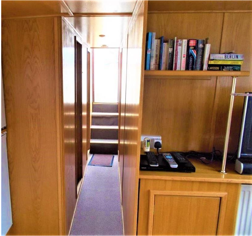
A companionway leads forward...