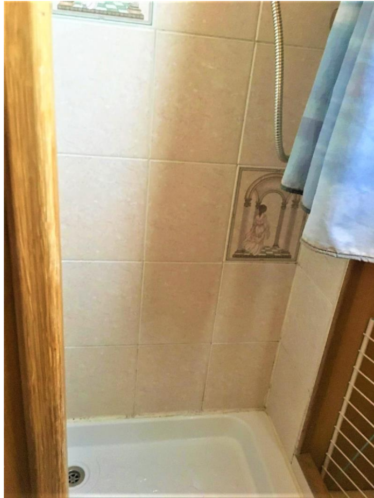
...to a separate WC and shower on the left...