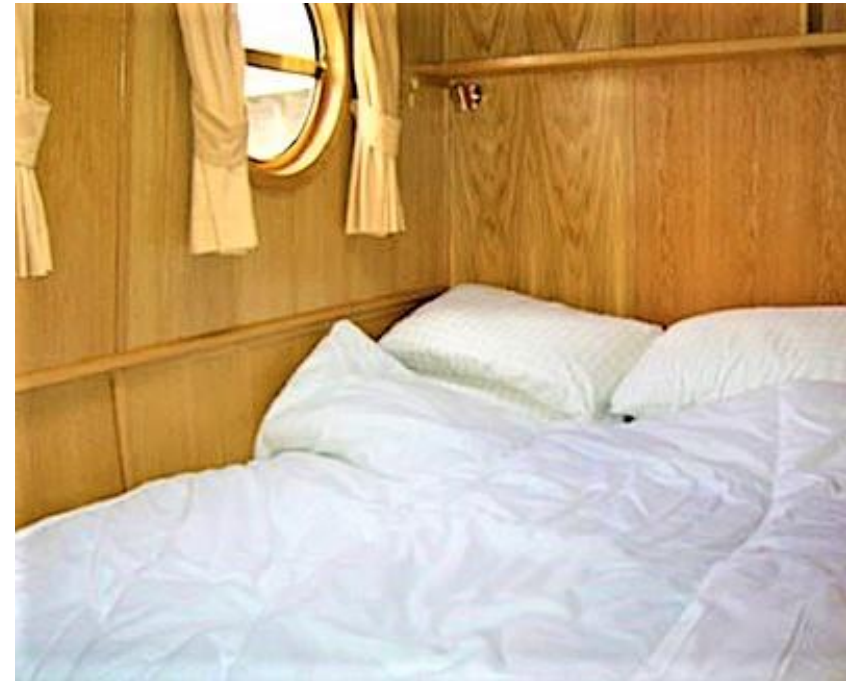
...and a double 'guest' cabin on the right. A bow door leads to the bow front which has seating with storage and access to gas bottles.