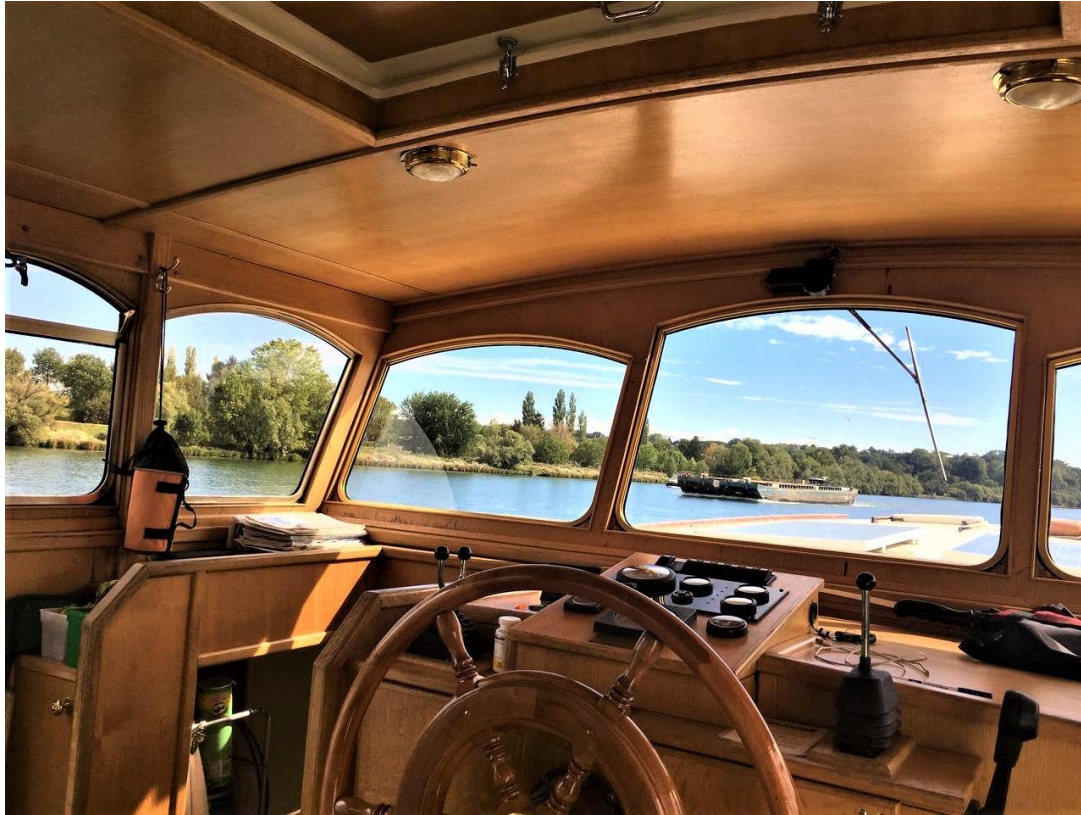
Aboard the Bon Viveur