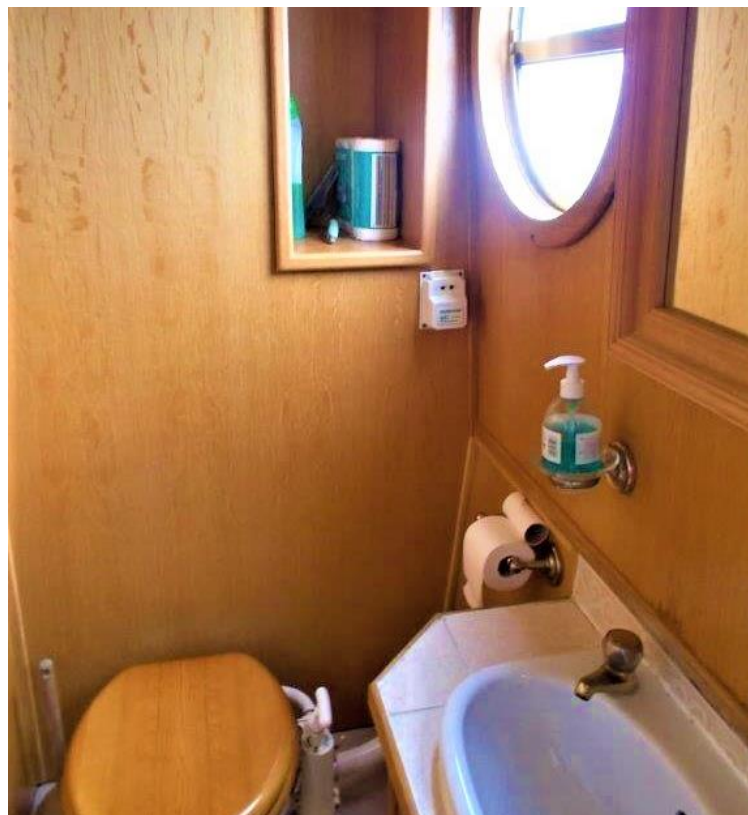
.....with en suite shower and WC.